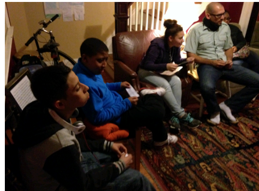
Junior youth, youth and adults in Edgewood gather for some spiritual food at their weekly devotional.

* Please send pictures and stories of your JY group and activities to Nicole Rouhani.