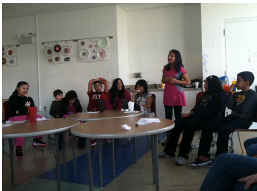
Junior youth in Columbia Heights planned a gathering attended by children and parents to celebrate their completion of Glimmerings of Hope and share what they had learned.